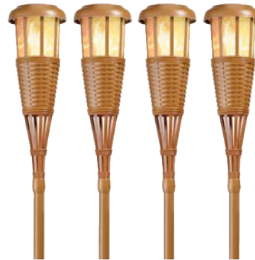
BAMBOO OUTDOOR SOLAR ISLAND TORCHES WITH FLICKERING FLAME (SET OF 4)