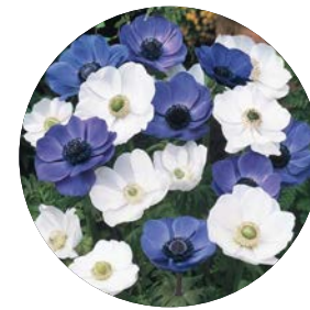
POPPY ANEMONE MIXTURE