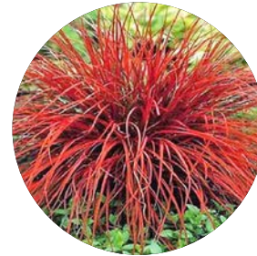
RED SEDGE GRASS