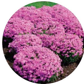
CREEPING PHLOX, CREEPING THYME, OR SEDUM