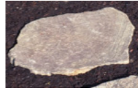
NATURAL STONE PAVERS