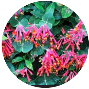
CLIMBING CORAL HONEYSUCKLE