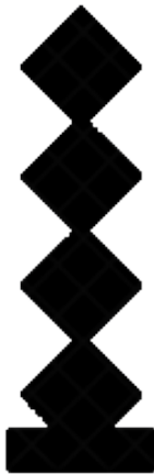
HOME-GROWN SCULPTURE BY WHOEVER