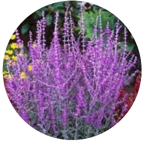
RUSSIAN SAGE, SALVIA, CATMINT OR LAVENDAR