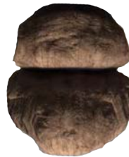
GNOME STACKED STONE SCULPTURE