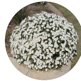
BUSH MORNING GLORY