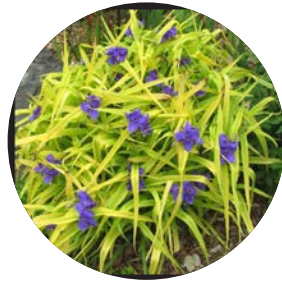
SPIDERWORT OR EUONYMUS