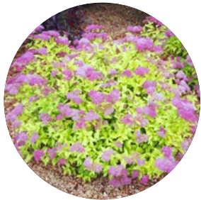
GOLD MOUND SPIREA