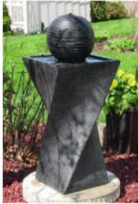
SOLAR FOUNTAIN BIRDBATHS